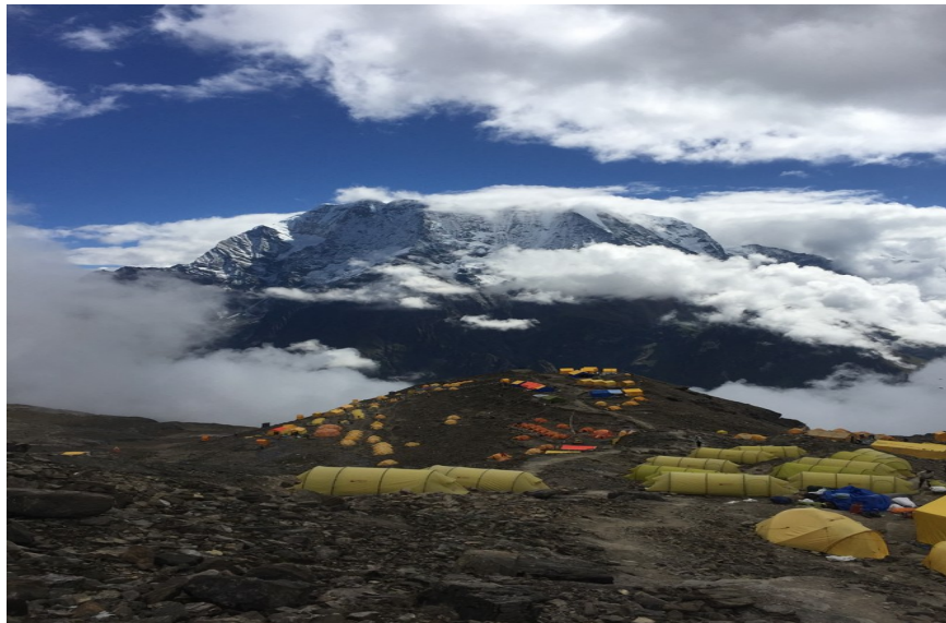
Basecamp on Mt Manaslu

Online presence : is already active and strong and creating much demand through Facebook, Instagram, Twitter, Goodreads and continuous blogs / updates on my website.